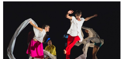
Impressions of Da-On