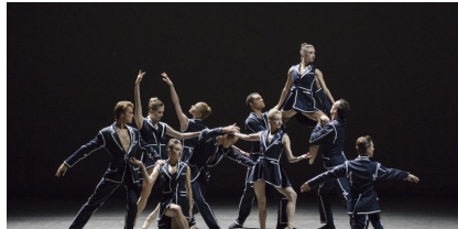
Impressions of New York