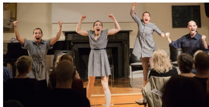
IMPRESSIONS OF: 10th