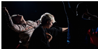
Dance Enthusiast Review-